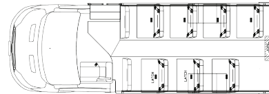
TH/TL400 14 Passenger (non-CDL)