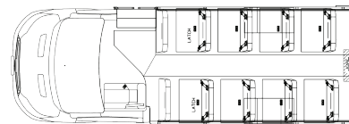
SH400 16 Passenger